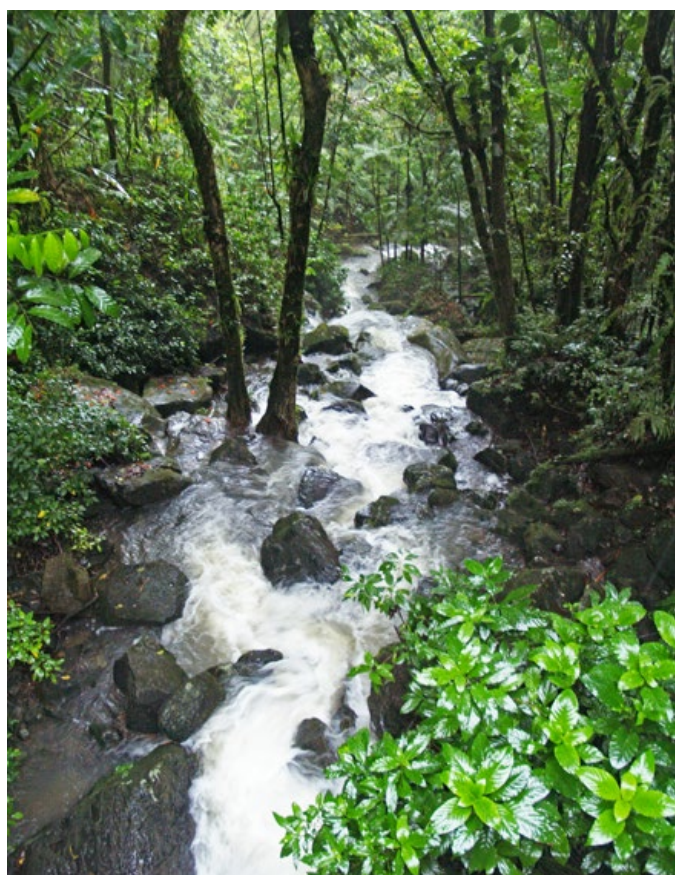
Figure 1. Water is considered one of the most important ecosystem services of El Yunque.

services. Forest managers also chose supporting services as most important.