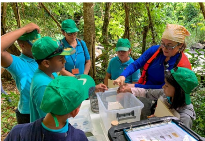
Figure 4. At the Sabana River in El Yunque, elementary school students learn about freshwater shrimps and their importance to all streams and rivers.